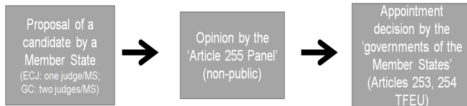
Figure 1: The selection of CJEU judges post-Lisbon

The Panel's opinions are legally non-binding. However, in practice, the Panel has gained important influence. Its principled lever lies in the structure of appointments. The Member States appoint judges and Advocates General by unanimity and the 255 Panel's opinions are communicated to all Member States. Hence, all Member States would have to agree to ignore the Panel's views as regards a candidate, a situation that is very unlikely to occur. 73 From March 2010 to February 2018 the Panel has delivered a total of 147 opinions, 74 of which were on candidates who were proposed for a renewal of office and 73 on candidates for a first term of office. While candidates for a renewal of office were all deemed suitable, of the 73 opinions on candidates for a first term of office, 14 opinions (19,2 percent) were unfavorable. 74 All of the Panel's 14 negative opinions have been followed by the Member States and accordingly new candidates have been proposed. 75